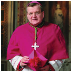
Cardinal Raymond Burke