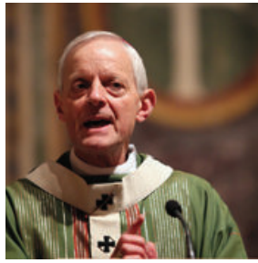
Cardinal Donald Wuerl