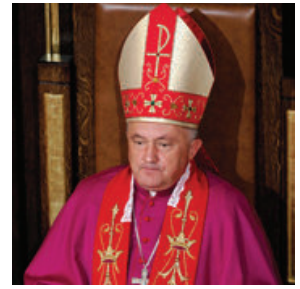
Cardinal Kazmierz Nycz