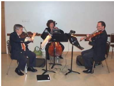
The Saelig Trio serenades guests at Trinity Council's April 17th Charity Dinner.