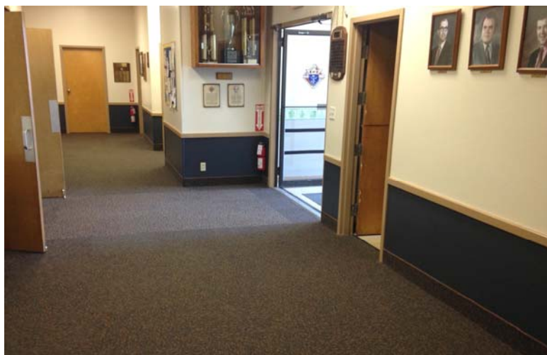
A look inside the freshly painted WCC.

A stark change from previous, but it looks like a million bucks.